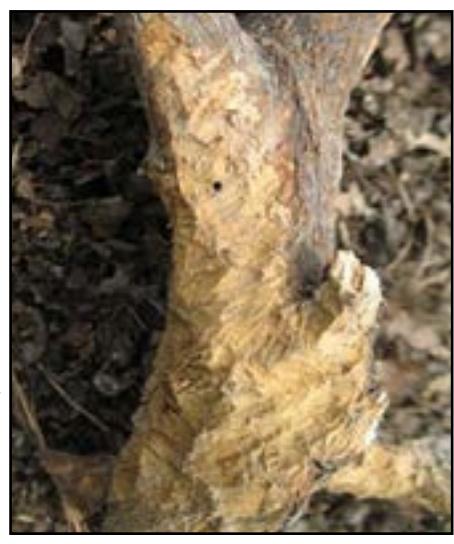
Figure 6-7. Vole damage to tree trunk. (Missouri Botanical Garden)

Chipmunks are active during the day in the spring, summer, and fall, but hibernate underground in the winter. They will store nuts and seeds in their burrows during the late summer and early fall to prepare for colder months in which they cannot go out to forage for food. There are only a few species that hibernate all through the winter as most chipmunks do not store a layer of fat in preparation for hibernation and must leave their burrow on warmer winter days to forage.