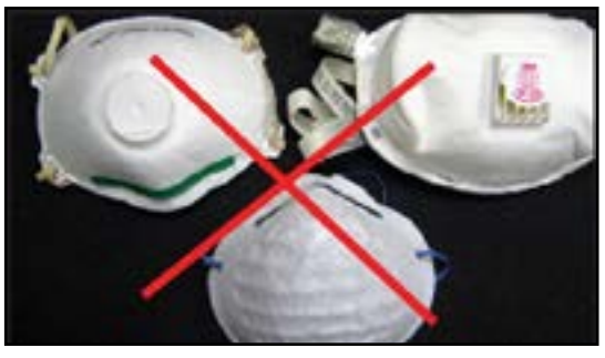
Figure 4-1. Particulate respirators. Never use dust/mist respirators, including "N-95s", for any fumigant work.

Because the air-purifying elements (cartridges and canisters) have a finite capacity to remove contaminants from the air, they