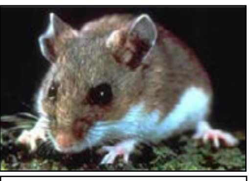
Figure 6-9. Deer mouse.

Sometimes referred to as the brown rat or sewer rat, the Norway rat ( Rattus norvegicus ) creates open burrow systems around buildings, under debris or piles of wood, and in fields with areas of high moisture. These burrows contain nests often lined with scraps of paper, insulation, and other shredded materials. These rats weigh approximately 12 to 16 ounces and are about 16 inches in length, including their tail. You can identify Norway rats by their blunt snouts, small beady eyes, small ears, shaggy fur, and scale-like tail that is shorter than the length of the body and head combined (Figure 6-10). Do not confuse the Norway rat with the Roof rat ( Rattus rattus ). The Norway rat is larger and more aggressive than the Roof rat.