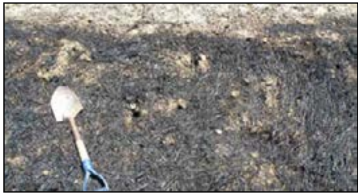
Figure 6-2. Typical California ground squirrel burrows on waterside slope of a clayey levee. (Department of Civil and Environmental Engineering. University of California, Berkeley, CA.)

Breeding season for California ground squirrels is dependent on climate and location. Those that live in colder areas at higher altitudes will hibernate longer, thus postponing the breeding season. In areas where the weather is warmer, breeding season can last from January to July. Female California ground squirrels reach sexual maturity at about one year of age and produce one litter per year with an average of 5 to 8 young per litter.