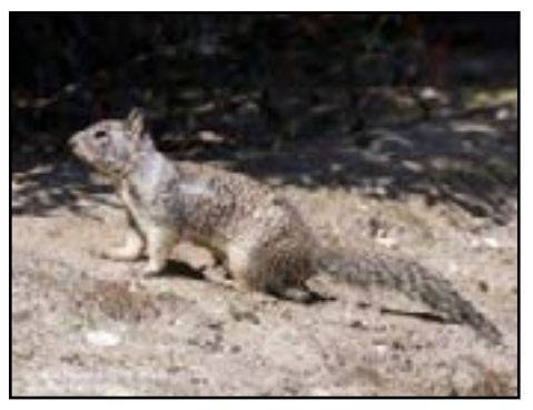
Figure 6-1. Adult California ground squirrel.

Another ground squirrel species, the Belding's ground squirrel ( Uroc-itellus beldingi ), lives in the northeastern part of California. Belding's ground squirrels may inhabit and cause problems in agricultural areas