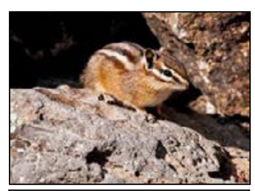
Figure 6-8. The Yellow-pine chipmunk.

Chipmunks have open system burrows but create two different types of open system burrows, one for foraging and one for nesting. Their foraging burrows tend to be much closer to the surface so that they can quickly escape danger, while their nesting burrows extend as deep as three feet underground to provide adequate shelter for their young and for themselves during hibernation. These burrows can be destructive when built underneath structures, including those where produce is stored. Structures such as greenhouses may be damaged by chipmunks if the greenhouse is in or near wooded areas, a habitat preferred by chipmunks. Additional damage comes from chipmunks digging for plant roots and uprooting plants. Chipmunks may get into food and grain storages, but chipmunks rarely cause economic damage to crops.