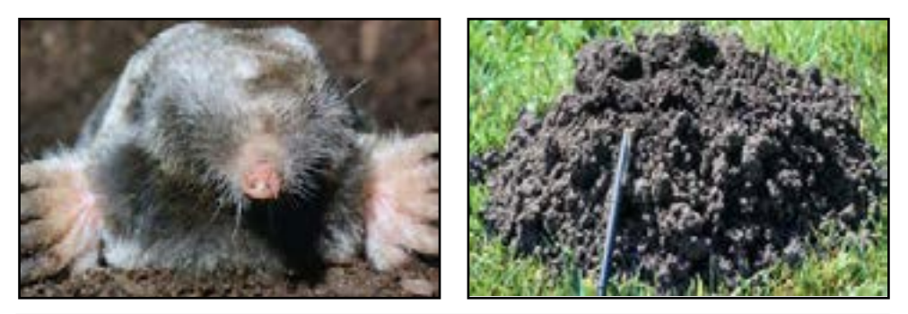
Figure 6-12 (left) and Figure 6-13 (right). (left) Photo of a Townsend's mole emerging from its burrow. (Vertebrate Pest Control Research Advisory Committee) (right) Mole mound. (Vertebrate Pest Control Research Advisory Committee)

Mole damage is mostly due to their burrow systems. When creating their burrows, moles can uproot plants and other greenery. Moles often inhabit the same areas as pocket gophers and can be found in neglected orchards or grain crops where insects are present.