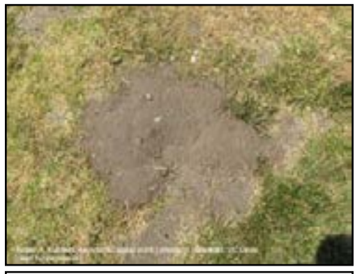
Figure 6-4. Pocket gopher burrow.

Of the six vole species that are found in California, the most prevalent are the California vole ( Microtus californicus ) and the Montane vole ( Microtus montanus ). Voles, also commonly referred to as meadow mice, are often confused with house mice due to their small size (roughly 5 to 8 inches in length including the tail), short legs, seemingly hairless tail, small beady eyes, and small round ears (Figure 6-5). Voles spend most of their time in their burrows and are active from ground level to about 6 to 8 inches below ground. Vole burrows are shallow, open burrow systems that are typically no larger than 200 square feet, with entrances that can range from 1.5 to 2 inches in diameter (Figure 6-6). Vole burrows can be identified by the runways connecting burrow entrances that are typically hidden with grass, leaves, and other materials. You can also find vole scat in the runways and near the burrow entrances. Fresh vole scat is green in color and measures approximately 3/16 inch in length.