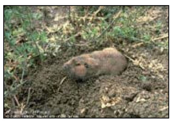
Figure 6-3. Pocket gopher in California.

These rodents reach sexual maturity in about one year and produce 1 to 3 litters per year with a litter consisting of 5 to 6 offspring. Pocket gophers are typically solitary and are only found with other pocket gophers during breeding season and when raising young.