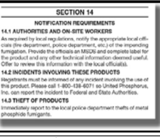
Figure 3-3. Notification requirements on a label. This section, taken from a phosphine fumigant product applicator's manual, shows that notification of local authorities may be required, especially in the case of accidents or theft of product. Note that the text refers to an "MSDS," which are now known as SDS.

to moisture and must be stored in a locked, dry, well-ventilated area. The product labels require the storage area must be posted with placards that use the National Fire Protection Association (NFPA) hazard classification system.