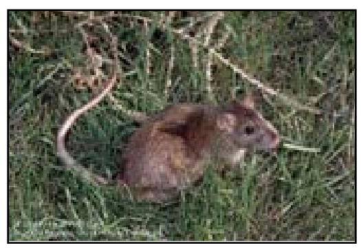
Figure 6-10. Illustration of a Norway rat. Note the blunt snout. (Jack Kelly Clark, UC IPM Program)

Roof rats ( Rattus rattus ) are sometimes referred to as black rats or ship rats. They are smaller than Norway rats and their tails are longer in comparison to the length of their head and body. These rats average 12 to 16 inches