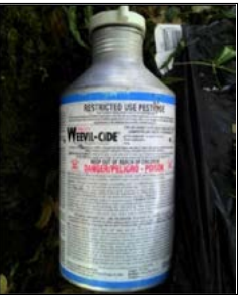
Figure 1-1. Sealed aluminum flask containing aluminum phosphide tablets.

When exposed to moisture in the air, aluminum and magnesium phosphide react to release phosphine gas. Phosphine (also called hydrogen phosphide) is a toxic gas and is about 20% heavier than air. Aluminum phosphide tablets are larger than pellets and release more phosphine. However, the smaller pellet form of aluminum phosphide reacts faster than the larger tablet. Aluminum and magnesium phosphides typi-