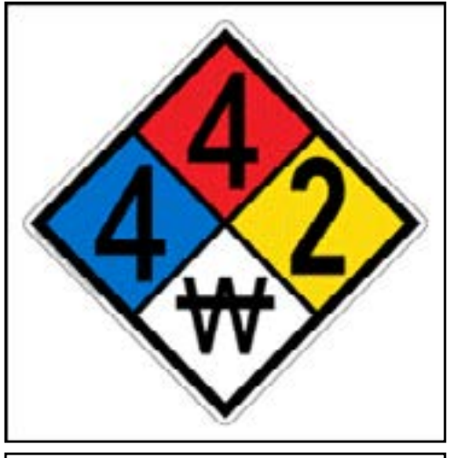
Figure 3-7. An example of an NFPA placard.

If a spill, leak, or other sudden release occurs, evacuate the immediate work or storage area. Always put on appropriate PPE before attempting to move the leaking or damaged container outdoors or to an isolated area. Be familiar with and follow label instructions for handling leaks. Follow label requirements, such as using monitoring equipment to determine the concentration of the fumigant in the ambient air. Until the safe concentration threshold on the label is met, anyone entering the area must wear an approved respirator.