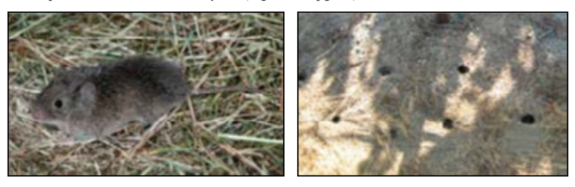
Figure 6-5 (left) and Figure 6-6 (right). (left) Vole. (Vertebrate Pest Control Research Advisory Committee). (right) Vole burrow entrances. (Vertebrate Pest Control Research Advisory Committee).

Voles can cause damage to field crops and vineyard crops. Vole populations as high as 1,000 voles per acre have been reported in alfalfa fields, causing significant damage. Voles can also cause significant damage in small tree orchards, such as pears, where they will girdle the tree by gnawing or feeding on the bark around the base of the tree. Although voles typically damage trees at the base or beneath the soil, they can climb low hanging tree limbs and cause damage up higher on trees. Vole damage is recognizable by irregular shaped gnaw marks (which are typically 3/8 inch long and 1/8 inch wide) and tree girdling which can cause abnormal yellowing of the leaves, slow fruit development, and decreased fruit yield (Figure 6-7, pg. 44).